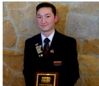
2018 BPA Student of the Year

This award is very special to me since it signifies that all those late nights working on presentations/business plan, studying for a test, or taking on different leadership roles helped further the advancement of this organization